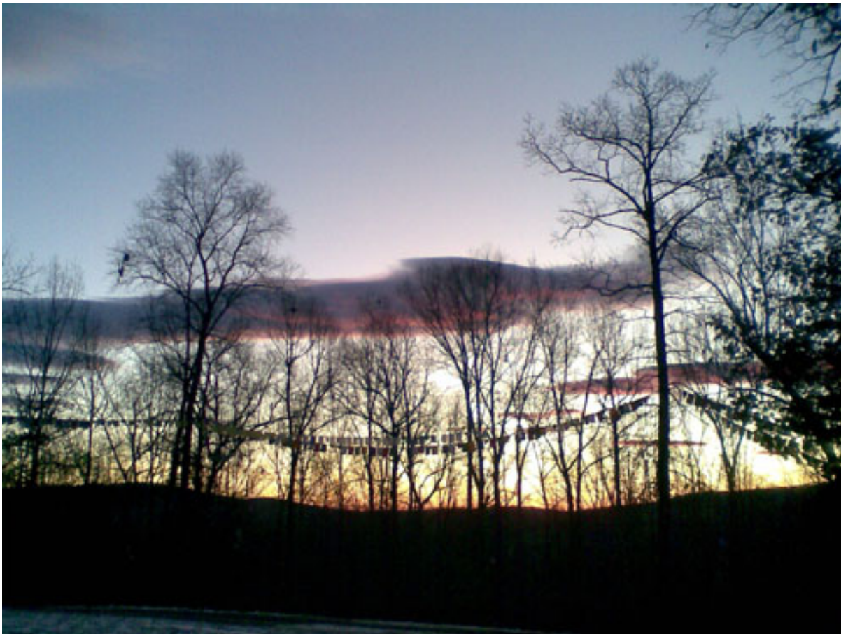
Photograph of Serenity Ridge

We invited sangha members to share their personal experiences from the recent winter retreat at Serenity Ridge. Here are four offerings.