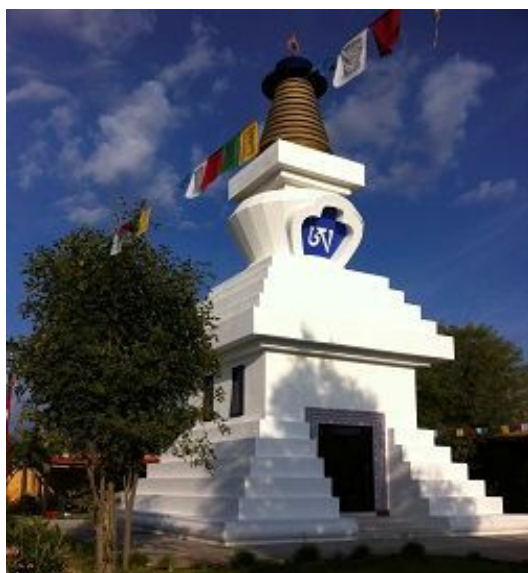
Stupa Chamma Ling Torreón