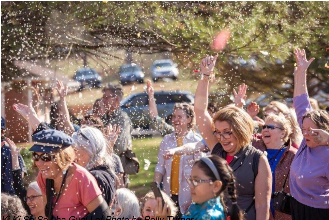
Ki Ki So So ha Gya