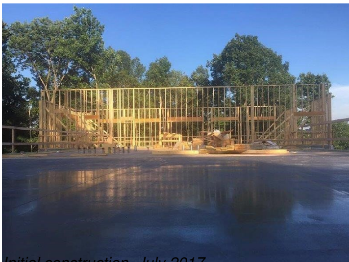
Initial construction. July 2017