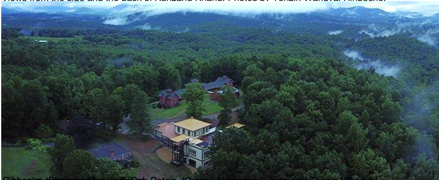
Photograph of Kunzang Khang by Tenzin Wanaal Rinpoche, Khenpo Ngawang Dorjee and Tenzin Wangyal Rinpoche.