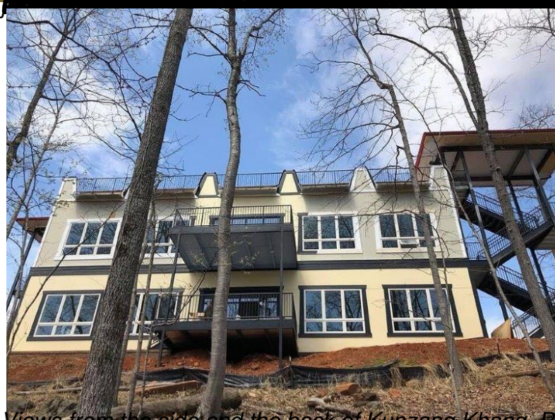
Views from the side and the back of Kunzang Khang.