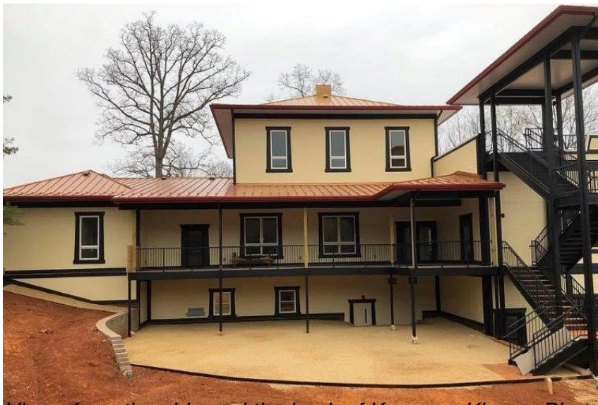
Views from the side and the back of Kunzana Khang.